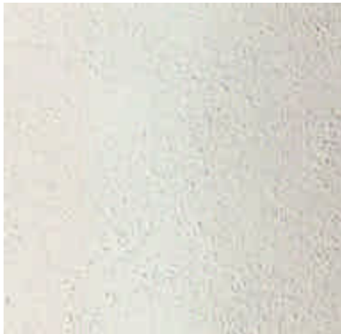
Sprayed On With Texture Sprayer

CLOSE THE PAIL TO PREVENT DRYING OUT. WASH ALL TOOLS IMMEDIATELY!