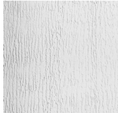
Applied With Sponge Roller and Knocked Down with Trowel