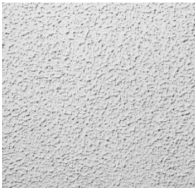
Applied With Sponge Textured Roller