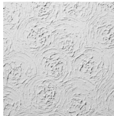
Applied With Sponge Roller and Textured With Texturing Sponge